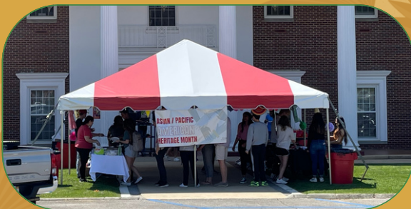
APAHM party at the International House

Later in the month there was a party at the International House for Asian Pacific American Heritage Month. Students enjoyed eating great food and playing some games!