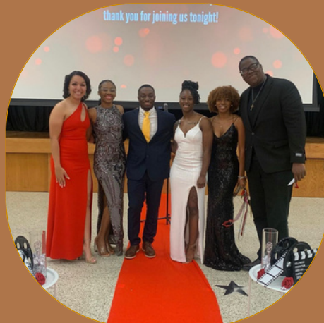
Members of the BSU at the NAACP awards