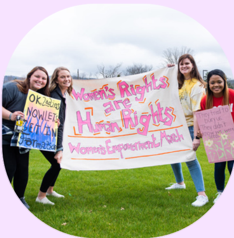
Students with signs for the Womens March

Last month Hammond Hall also held a juried student art show in honor of WHM. They displayed local talents from March 3rd - 31st .