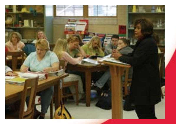
Page 15 CE&PS Annual Report 2004

to the fact that as an educator just entering the workforce, I need to be aware of all the issues that surround a child. A child's socioeconomic condition and home life will be a factor in my success as a teacher. I think all citizens and all lawmakers must address some of these issues, if educators are to produce the high quality of society members that are expected by NCLB."