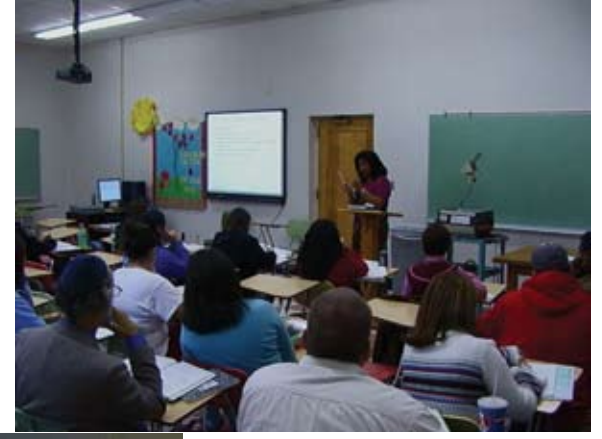
Education. In 1996 the name of the College changed to the College of Education and Professional Studies. The CE&PS Faculty requested a technological renovation; the College experienced this renovation in 2004. Thirteen classrooms and one conference room in

The Ramona Wood Building was dedicated in 1939 as the library for JSU. In 1966, the building was renovated to house the College of