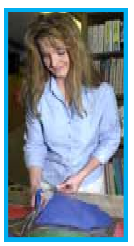
"The LRC is like a library with more than books... CD's, laserdisks, games different approaches to teaching."

The LRC is open weekdays from 8:00 A.M. to 12:00 P.M. and 1:00 P.M. to 4:30 P.M.